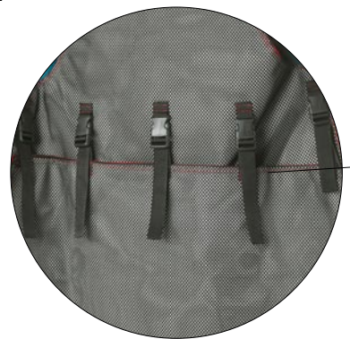
Adjustable height of the Apron – safer, better comfort and can be used by different sized operators