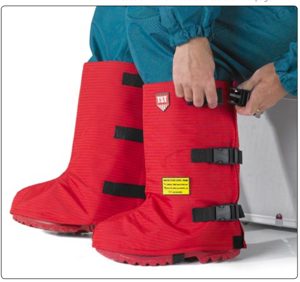
*Protection level – see test results on last page.