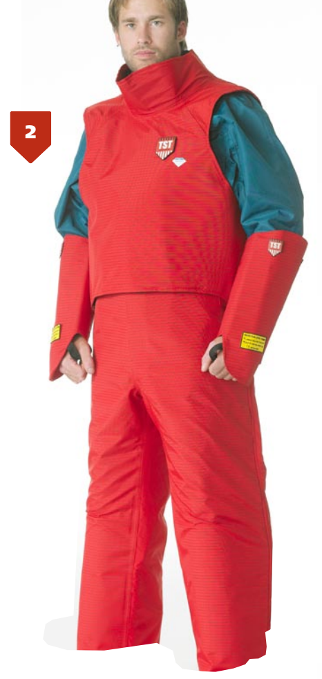
Foot protection is not included in the kits. See page 13.