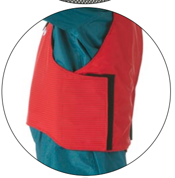
A higher cut in the front makes it easier to bend forwards.