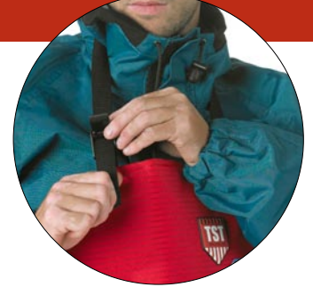
Adjustable neckband – optimal placing and comfort!