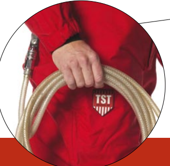
Ventilation – comfort option for warm environments.