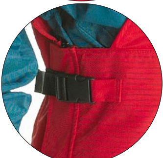
Waist adjustment for perfect fit.