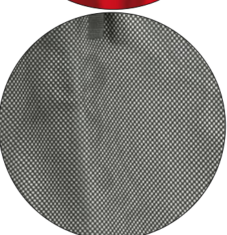
Mesh inner lining – comfortable for the operator and excellent drying.