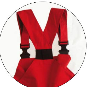
Comfort details in the back.